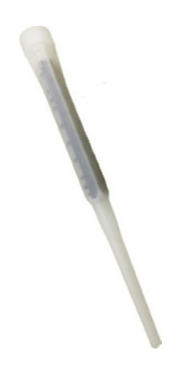
STATIC MIXING NOZZLE