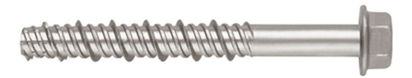
FIGURE 3-MANUFACTURER'S PUBLISHED INSTALLATION INSTRUCTIONS

The screw anchor is permitted to be loosened by a maximum of one full turn and retightened with a torque wrench or a powered impact wrench to facilitate fixture attachment or realignment